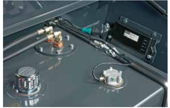
Access to the fuel and hydraulic tanks is easy.