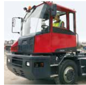
The swivelling seat makes access which is fully adjustable.