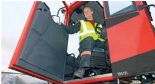
The wide-opening side door enables easy movement. The sturdy handles facilitate safe entry.