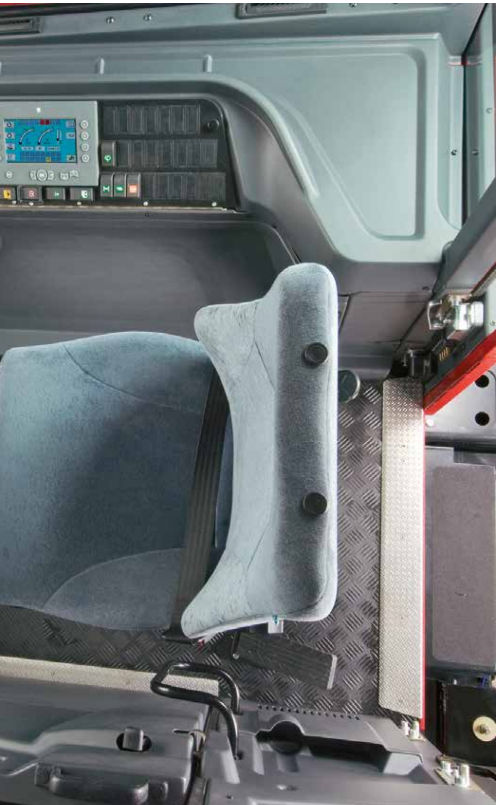
A clear and safe entrance from the rear deck to the cabin – with one low step.