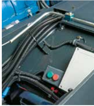
The external on/off switch enables quick service starts (an option).

Maintenance must not interfere with productivity. This is why icon features various improvements in daily service and adjustment procedures. And many of icon's service points are now easier to reach than before.